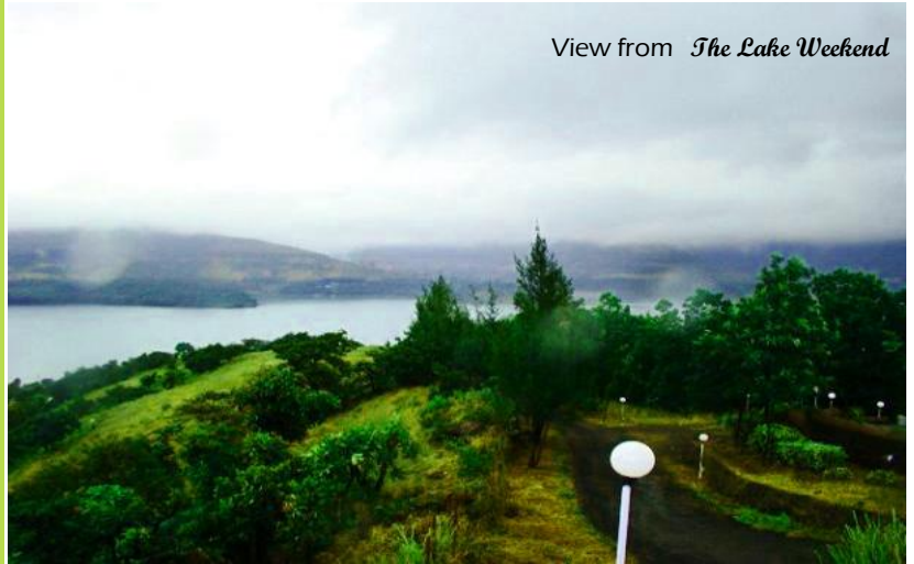
View from The Lake Weekend

A 7-days a week, 365-days a year recharge retreat for individuals, couples, families and Corporates, The Lake Weekend , a Pure Veg Resort located at a height of 2500ft above sea level; a location blessed with abundant nature, amazingly picturesque & scenic surroundings along the pristine blue Warasgaon Lake, to sit back, relax and enjoy being One with the Nature.