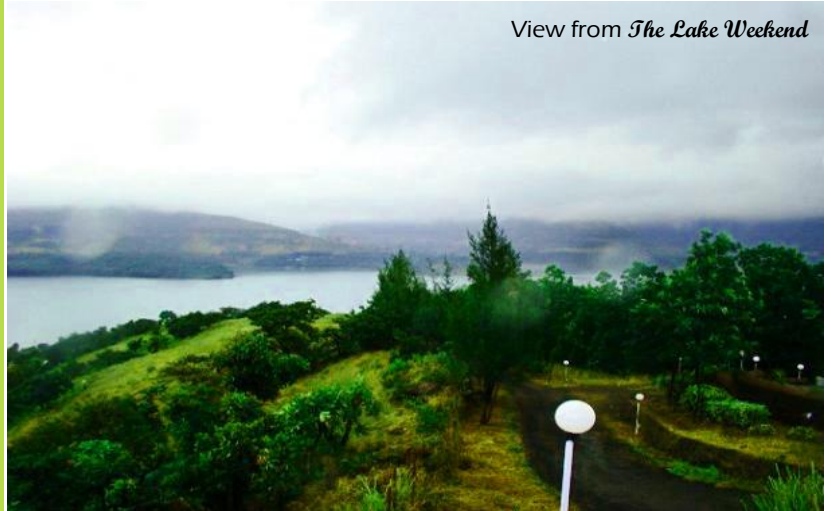
View from The Lake Weekend

A 7-days a week, 365-days a year recharge retreat for individuals, couples, families and Corporates, The Lake Weekend , a Pure Veg Resort located at a height of 2500ft above sea level; a location blessed with abundant nature, amazingly picturesque & scenic surroundings along the pristine blue Warasgaon Lake, to sit back, relax and enjoy being One with the Nature.